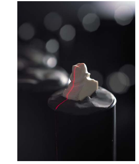
Fig 1: Laser Scanning of a Die

is particularly suitable for implant borne full arch / beam restorations which we now manufacture for all major implant systems under our Straumann Platinum accredited implantology services.