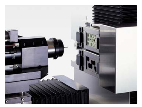
Fig 2: CAM milling in progress

As part of the manufacturing process we laser scan models and dies to a resolution of 10 microns, producing crowns and large bridges that have excellent strength and fit.