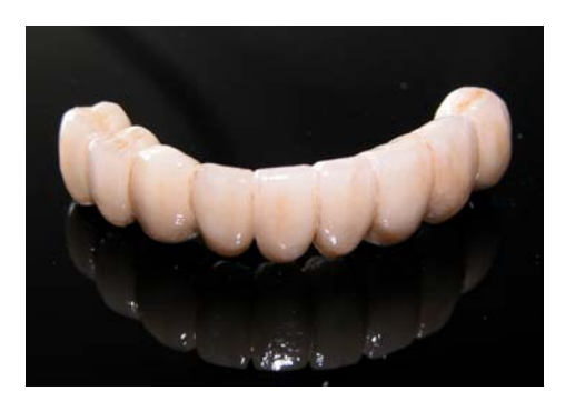
Fig 3: 9-unit zircon all ceramic implant bridge

See overleaf for our Special Summer offer on CAD-CAM restorations. All our work is made in the UK.